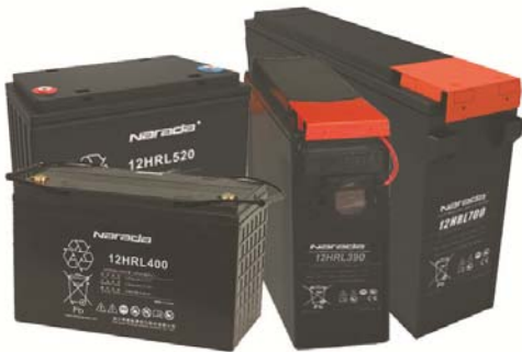
NARADA HRL Series batteries

China: Narada NARADA POWER SOURCE CO.,LTD. No.459 Wensan Road, Hangzhou, Zhejiang, P.R.China Tel:+86-571-28827013 Fax:+86-571-85126942 Website:www.en.naradabattery.com E-mail: intl@narada.biz