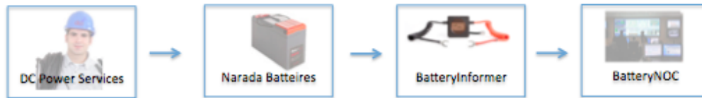
Enterprise End-to-End Solution

BatteryInformer® monitoring technology, together with Narada Power Sources batteries and installation services, offers companies a comprehensive enterprise solution to leverage their purchasing power which lowers their cost of batteries, installation and management.