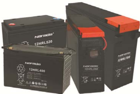
NARADA HRL Series batteries

NARADA POWER SOURCE CO.,LTD. No.459 Wensan Road, Hangzhou, Zhejiang, P.R.China Tel:+86-571-28827013 Fax:+86-571-85126942 Website:www.en.naradabattery.com E-mail: intl@narada.biz